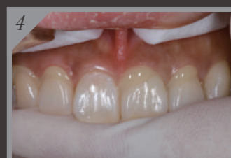
4 Place the restoration on the tooth with firm pressure