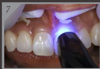
7 Final PASTE hardening by light curing for 20 seconds or more

※ Light-cure along margins for 20 seconds or more in case of non translucent restoration