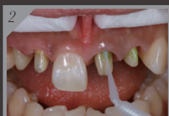
2 Tooth pretreatment with ESTELINK