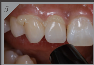
5 Light-cure the excess PASTE with a dental curing light for 2 to 4 seconds