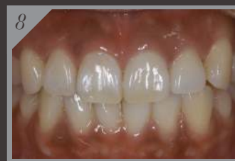
8 Finished restoration

※ Light-cure along margins for 20 seconds or more in case of non translucent restoration