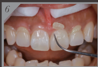
6 Remove the excess PASTE